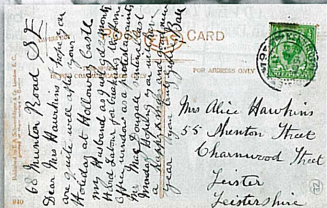
Right: Some of the memorabilia passed down the family and now freely available to view on the website.

Printed and Published by the Artists' Suffrage League, 239 King's Road, Chelsea.